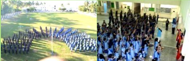
ANNUAL SCOUTS & GUIDES CAMP

For kids, time spent camping is time spent learning, which is one of the reasons why scouting and IAYP programmes are so valuable. These activities help children to gradually become more independent and confident in their own capabilities.